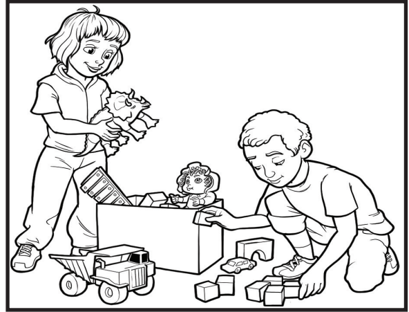
Pick Up Your Room