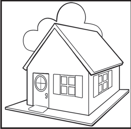
Live at Home